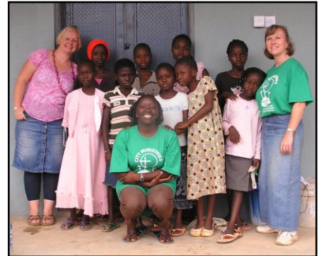
My hut was Love Hut

Camp this year was from August 14-20. The first three days were Jr. Camp and the last three days were Sr. Camp. Our theme was Ephesians 2:10 "We are God's workmanship, created in Christ Jesus to do good works, which God prepared in advance for us to do." The first lesson was on temptation and how we deal with them using the example of Jesus when he was tempted in the desert. The second lesson was on the character of Christ and how we are to strive to be like Christ. God has given us many gifts that we can use to be a tool for His good works. The third lesson was on good works and commitment to God. What is your commitment to God? What are you going to do with the good works He has prepared for you to do?